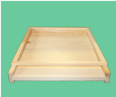
Fig. 1—Spacer Strip Installation Standard bottom board shown