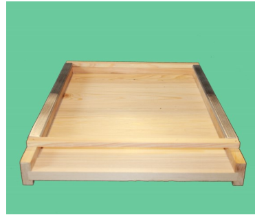
Fig. 2—Side Rail Placement Standard bottom board shown